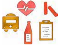
MANAGEMENT OF HEALTH